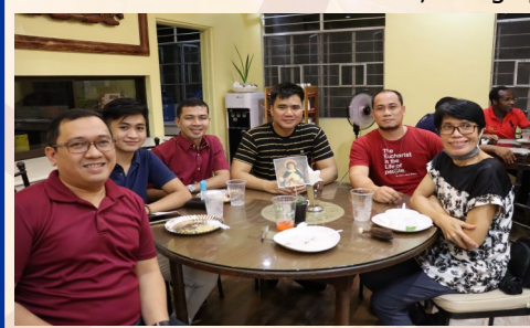
Such is the gift of the Advent and Christmas seasons. With the seminarians being renewed and energized on a daily basis by the real presence of Christ in the celebration of the Holy Eucharist, they are being given the divine gift to also be Christ's instrument in spreading His hope, love, and joy to others through the gift of their presence and communion.

also be physically in communion with the congregation's faithful collaborators, bighearted benefactors, and the many supporters and prayer partners they have met and kept along the way. It will be a "busybee" but blessed seasons. On top of the many Advent and Christmas-related activities, the seminarians will again have the chance to sing and render Christmas carols for selected communities, bringing