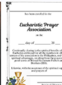
A Gift of Prayer - ₱200