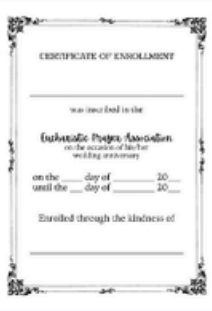
Spiritual Gift - ₱150