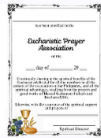
Mass Card - ₱200